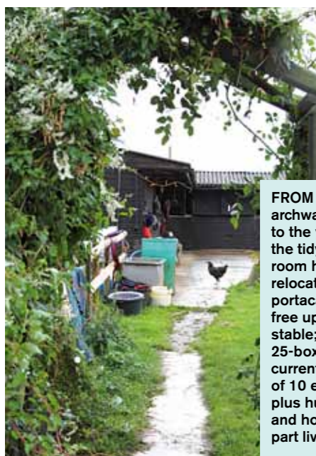
FROM LEFT The archway leading to the yard; the tidy tack room has been relocated to a portacabin to free up an extra stable; Ginny's 25-box yard is currently full of 10 eventers plus hunters and horses on part livery

"Socially I'm quiet during the summer but I enjoy the hunt ball scene in the winter," adds Ginny. "Having the horses on my doorstep is perfect. There will come a point when living with my parents isn't ideal so one day I will move out. I'll go somewhere locally and the horses will stay put. I'd be silly to take them anywhere else." E