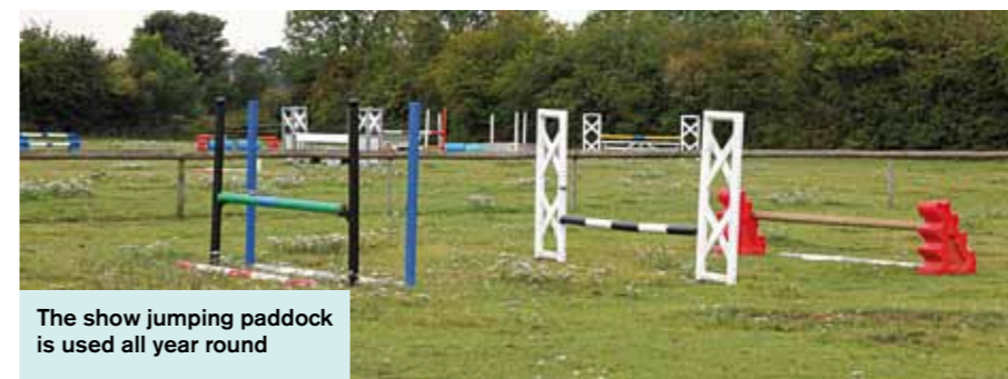
The show jumping paddock is used all year round

Money was invested in a portacabin and its two rooms are split into tack rooms. Facilities also include a rubber surfaced 25x50m outdoor arena with mirrors, a grass jumping paddock and a five-horse walker sited behind the stables.